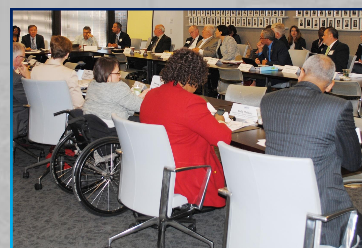
Identified Issues / Concerns / Solutions